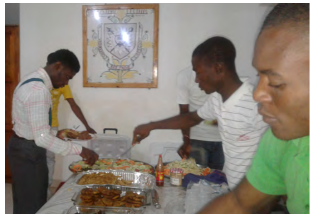
Below: The Sant Community enjoying a festive meal